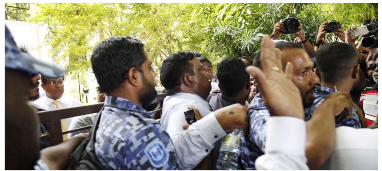
© Munshid Mohamed, 24 July 2017 - Police prevent Members of Parliament from entering the People's Majlis through the east gate