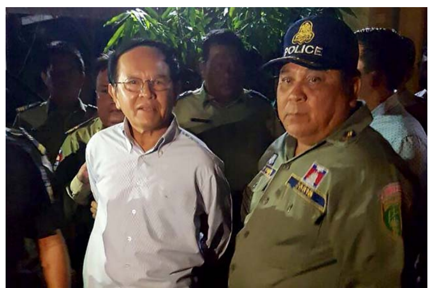
Kem Sokha is escorted by police at his home in Phnom Penh on September 3, 2017