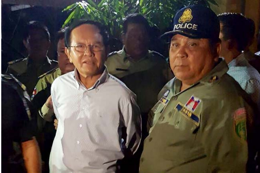
Kem Sokha is escorted by police at his home in Phnom Penh on 3 September, 2017

Decision adopted unanimously by the IPU Governing Council at its 202 nd session (Geneva, 28 March 2018)