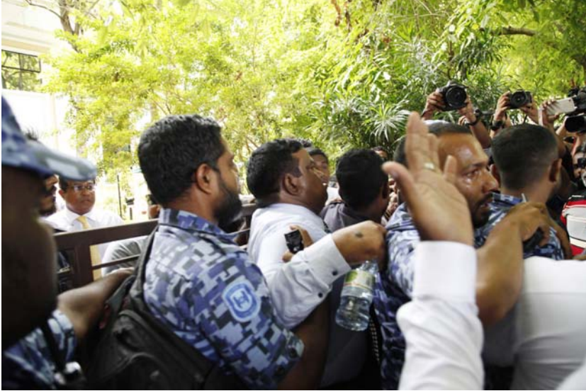
Police prevent members of parliament from entering the People's Majlis, 24 July 2017

Decision adopted unanimously by the IPU Governing Council at its 202 nd session (Geneva, 28 March 2018)