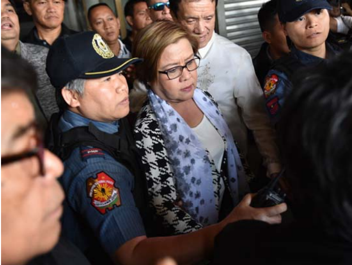
Senator Leila De Lima is escorted by police officers following her arrest at the Senate in Manila on 24 February, 2017

Decision adopted unanimously by the IPU Governing Council at its 202 nd session (Geneva, 28 March 2018)