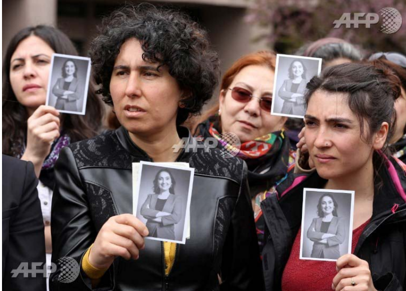
Demonstrators hold pictures of Figen Yüksekdağ during the trial in front of the court in Ankara on 13 April, 2017

Decision adopted by consensus by the IPU Governing Council at its 202 nd session (Geneva, 28 March 2018) 5