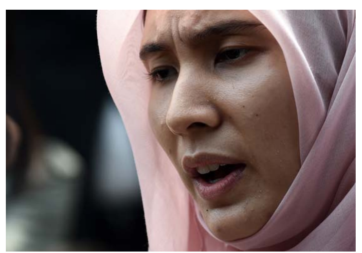
Nurul Izzah, daughter of Malaysian opposition leader, Anwar Ibrahim, speaks to the media after being released on bail on 17 March 2015.