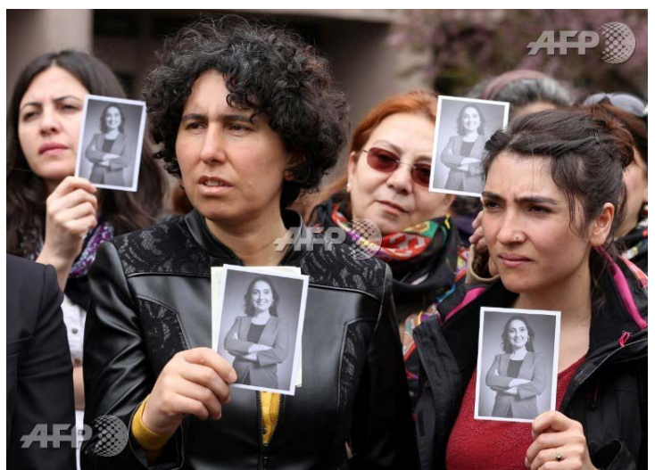
Demonstrators hold pictures of Figen Yüksekdağ during the trial in front of the court in Ankara on 13 April, 2017