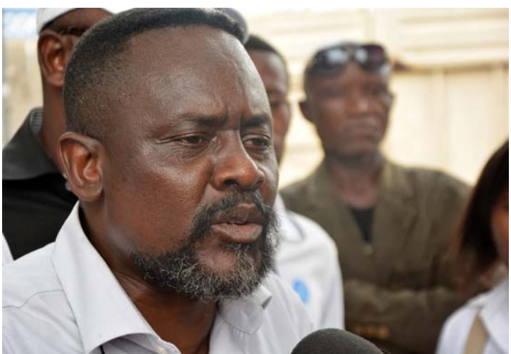
Franck Diongo, President of the MLP, Congolese Opposition Party