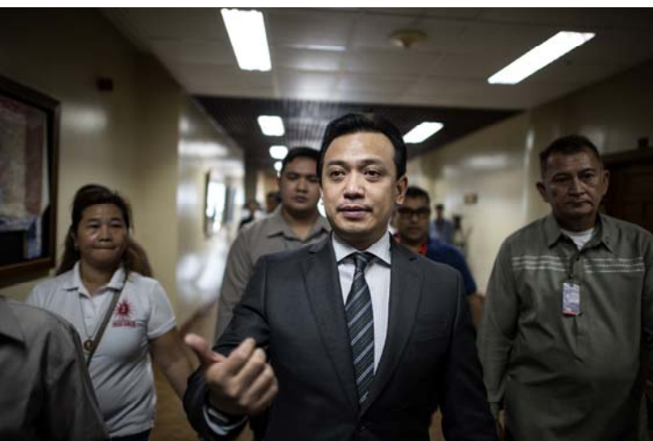
Senator Trillanes arrives at the senate building in Manila on 25 September 2018. Senator Trillanes, a vocal critic of President Duterte, was arrested but posted bail in proceedings that the lawmaker decried as a "failure of democracy".