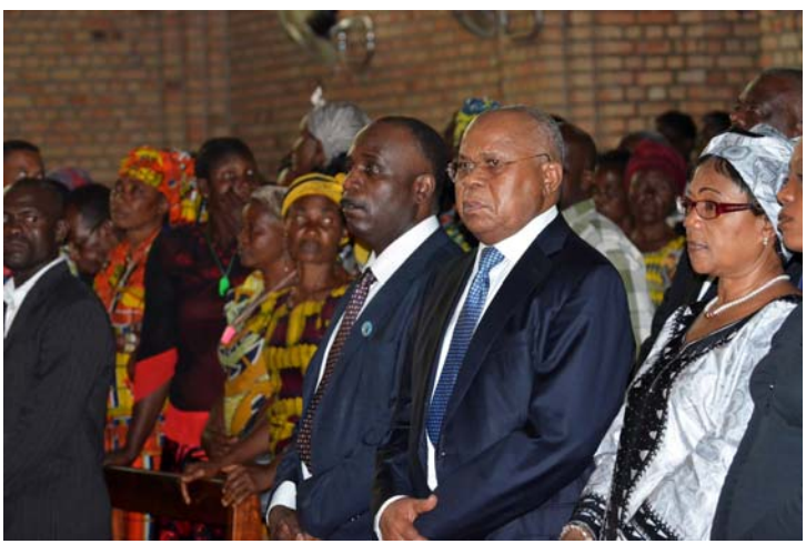
Opposition political leader Etienne Tshisekedi (Centre R) listens alongside opposition leader Eugène Diomi Ndongala (Centre L) during a "Peace in the East" mass on 22 June 2012