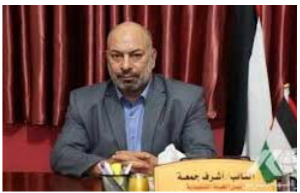
Ashraf Jumaa