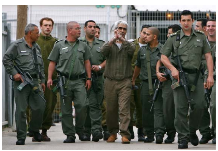
Ahmad Sa'adat, the leader of the Popular Front for the Liberation of Palestine, is escorted by Israeli border police to the Ofer military court in the West Bank, north of Jerusalem, 27 March 2006.