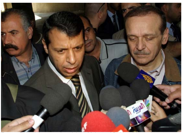
Former Palestinian security minister Mohamed Dahlan (L) speaks to reporters outside the offices of the Palestine Liberation Organisation, 8 November 2004.