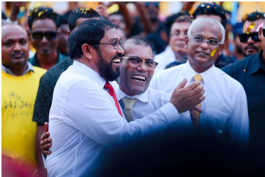
Former president of the Maldives, Mohamed Nasheed (centre), is embraced by Jumhoory Party leader, Qasim Ibrahim (left), as President-elect, Ibrahim Mohamed Solih (right), looks on after Nasheed returned from exile to the Maldives, in Male on 1 November 2018