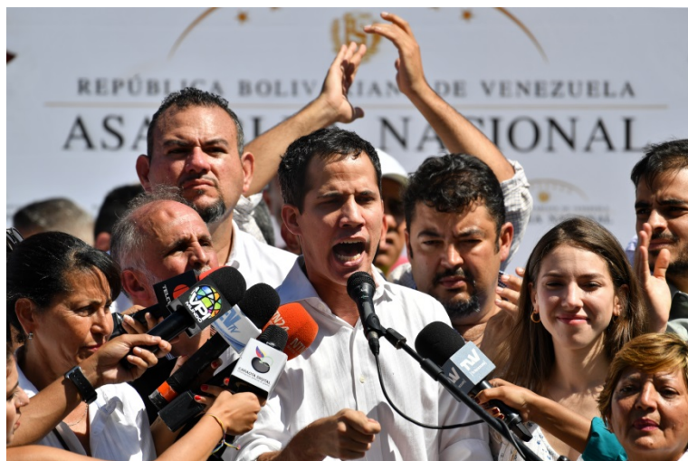
Venezuela's Speaker of the National Assembly Juan Guaidó speaks before a crowd of opposition supporters during an open meeting in Caraballeda, Venezuela, on 13 January 2019