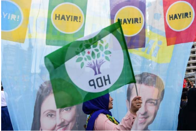
Pictures of Selahattin Demirtas and Figen Yüksekdağ, jailed leaders of the Pro-Kurdish opposition Peoples' Democratic Party, are seen on a flag as supporters of the pro-Kurdish opposition Peoples' Democratic Party (HDP) and of the 'Hayir' ('No') campaign attend a rally for the upcoming referendum in Istanbul, on 8 April 2017. On 16 April 2017, Turkey voted on whether to change the current parliamentary system into an executive presidency.