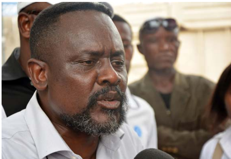
Franck Diongo, President of the MLP, Congolese opposition party