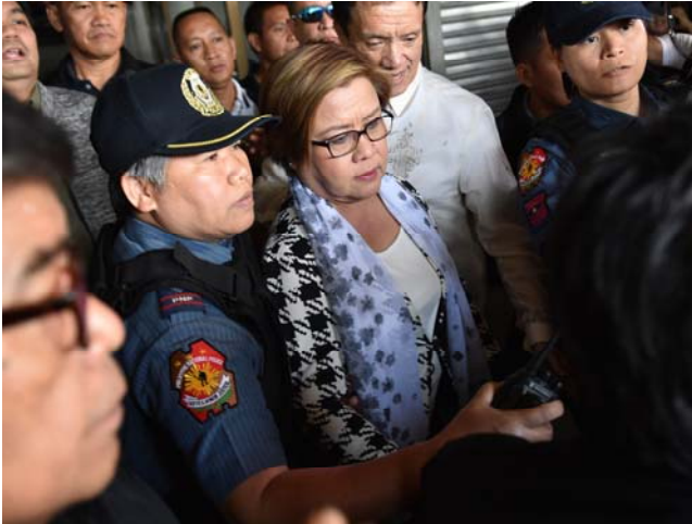
Philippine Senator Leila de Lima is escorted by police after her arrest at the Senate in Manila on 24 February 2017