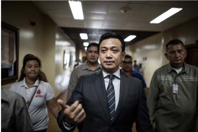
Senator Trillanes arrives at the Senate building in Manila on 25 September 2018. Senator Trillanes, a vocal critic of President Duterte, was arrested but posted bail in proceedings that the lawmaker decried as a "failure of democracy".