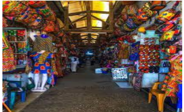
Accra Arts Center