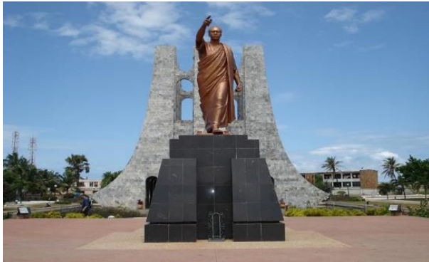
Kwame Nkrumah Mausoleum