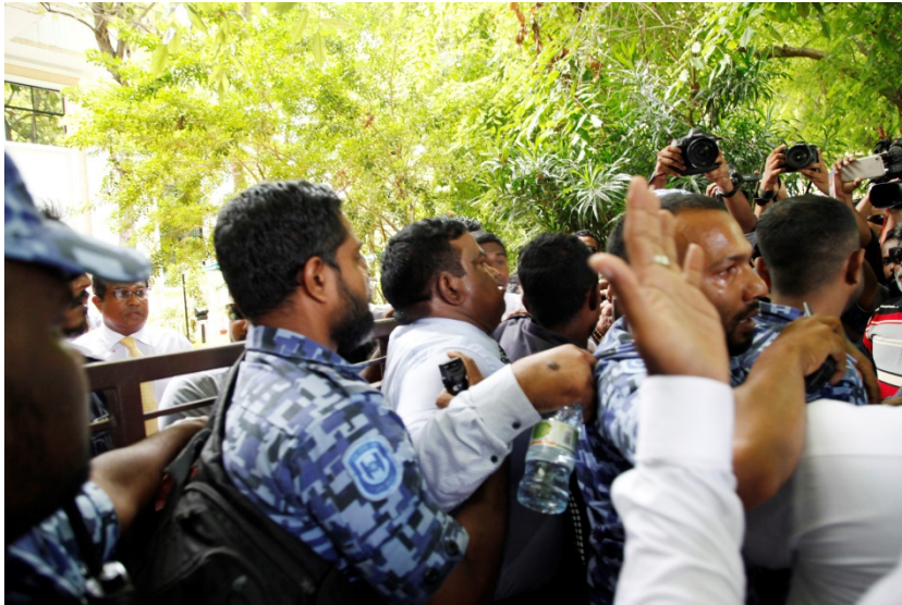
© Munshid Mohamed, 24 July 2017 – Police prevent members of parliament from entering the People's Majlis through the East Gate