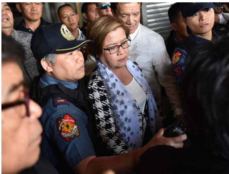
Philippine Senator Leila de Lima is escorted by police after her arrest at the Senate in Manila on 24 February 2017