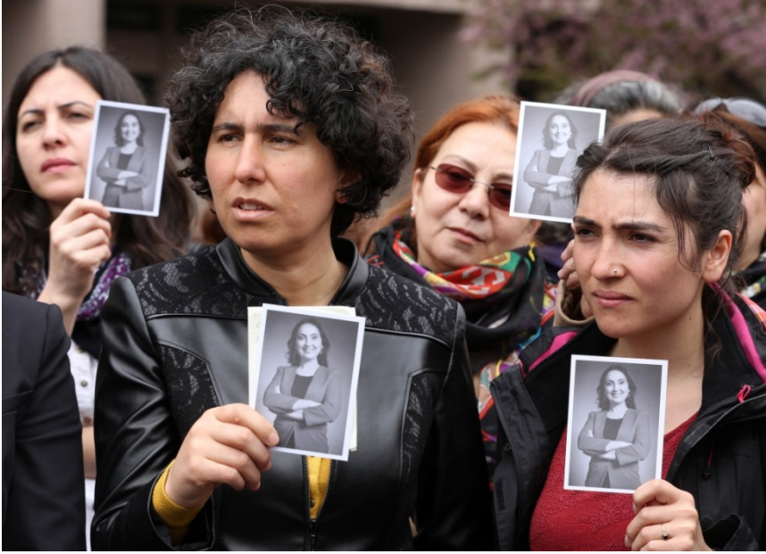
Demonstrators hold pictures of Figen Yüksekdağ during the trial of the co-leader of the pro-Kurdish party People's Democratic Party (HDP) in front of the court in Ankara on 13 April, 2017