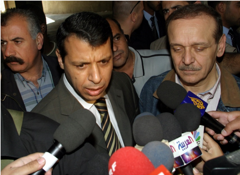
Former Palestinian security minister Mohamed Dahlan (L) speaks to reporters outside the offices of the Palestine Liberation Organisation, 8 November 2004.