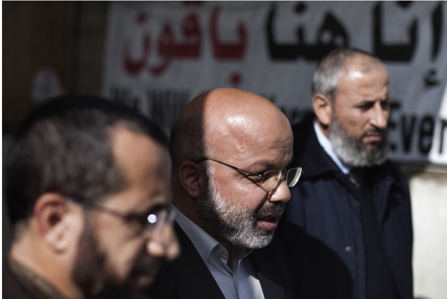
Hamas legislators sit in the International Red Cross offices where they have been living for the past 162 days fearing expulsion by the Israeli authorities, 9 December 2010.