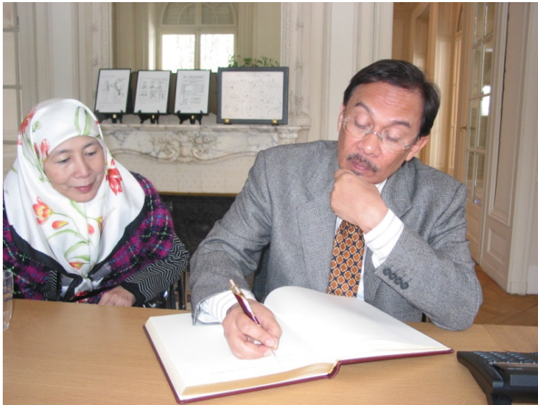
Mr. Anwar Ibrahim and his wife, at IPU headquarters, Geneva, 2005