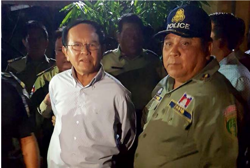
Kem Sokha is escorted by police from his home in Phnom Penh on 3 September, 2017