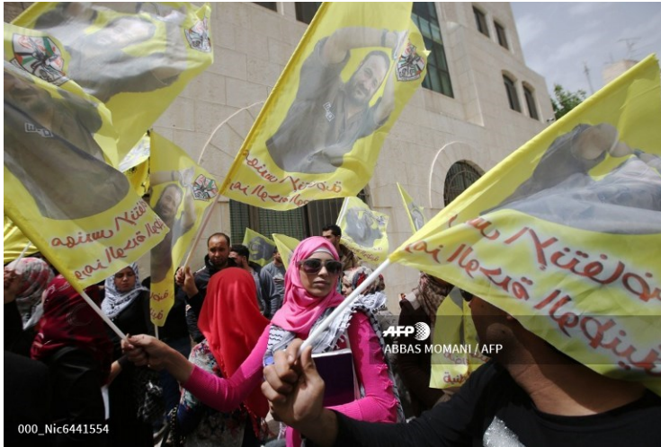
Ramallah, 15 April 2015 - Palestinian protesters wave flags bearing portraits of Fatah leader, Marwan Barghouti, during a march to mark the anniversary of his arrest.