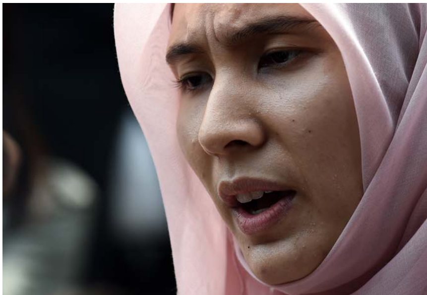
Nurul Izzah, daughter of Malaysian opposition leader Anwar Ibrahim speaks to the media after being released on bail on 17 March 2015.