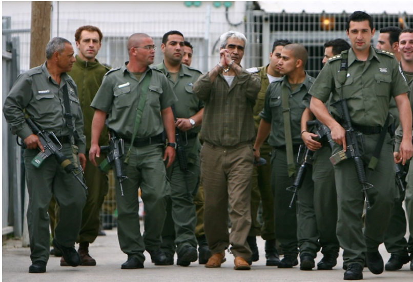
Ahmed Sa'adat, the leader of the Popular Front for the Liberation of Palestine, is escorted by Israeli border police to the Ofer military court in the West Bank, north of Jerusalem, 27 March 2006.