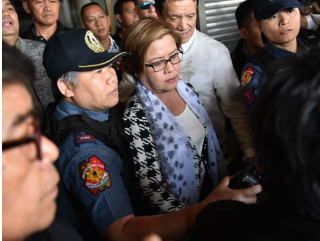
Philippine Senator Leila de Lima is escorted by police after her arrest at the Senate in Manila on 24 February 2017

Decision adopted unanimously by the IPU Governing Council at its 204 th session (Doha, 10 April 2019)