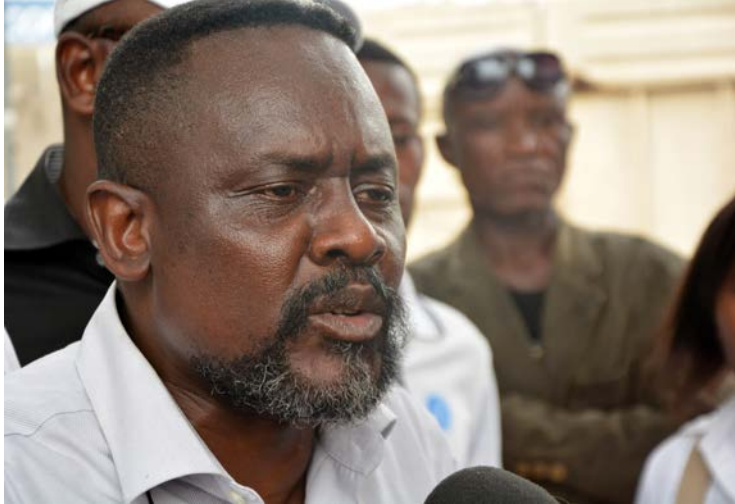
Franck Diongo, President of the MLP, Congolese opposition party

Decision adopted unanimously by the IPU Governing Council at its 204 th session (Doha, 10 April 2019)