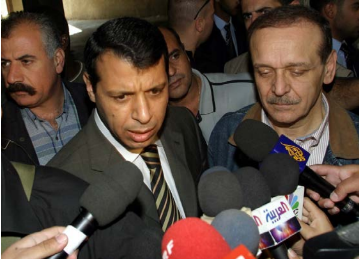
Former Palestinian Security Minister Mr. Mohamed Dahlan (L) speaks to reporters outside the offices of the Palestine Liberation Organization, 8 November 2004.

Decision adopted unanimously by the IPU Governing Council at its 203 d session (Geneva, 18 October 2018)