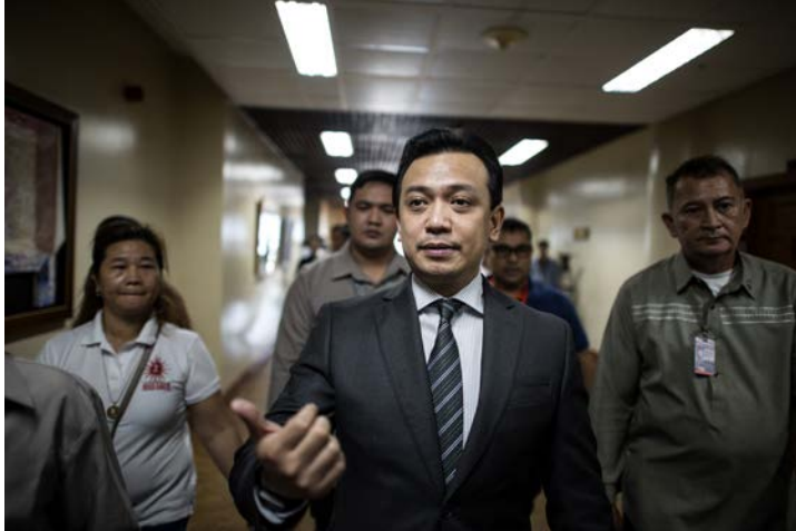
Senator Trillanes arrives at the Senate building in Manila on 25 September 2018. Senator Trillanes, a vocal critic of President Duterte, was arrested but posted bail in proceedings that the lawmaker decried as a "failure of democracy"

Decision adopted by consensus by the IPU Governing Council at its 203 rd session (Geneva, 18 October 2018) 5