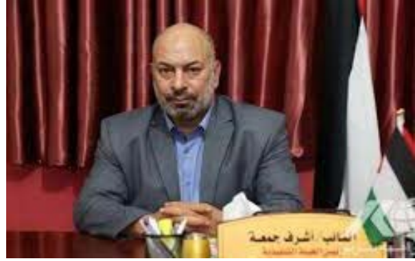
Ashraf Jumaa