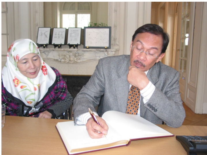
Mr. Anwar Ibrahim and his wife, at IPU headquarters, Geneva, 2005

Decision adopted unanimously by the IPU Governing Council at its 203 d session (Geneva, 18 October 2018)