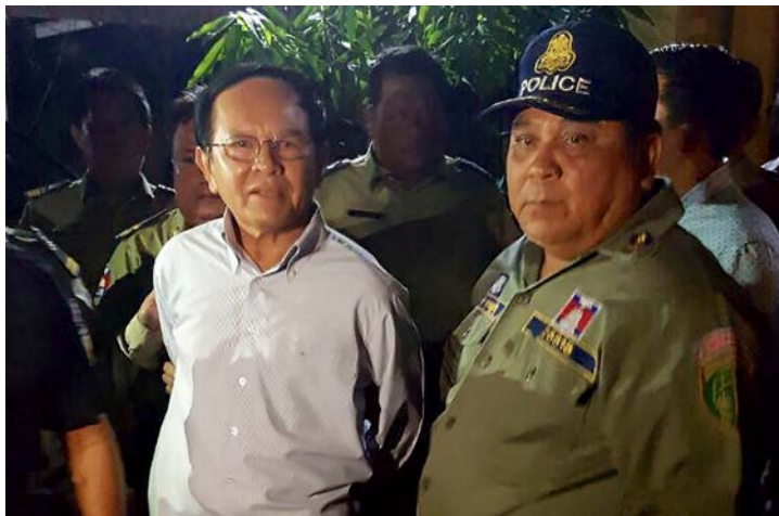
Kem Sokha is escorted by police at his home in Phnom Penh on 3 September 2017

Decision adopted by consensus by the IPU Governing Council at its 203 rd session (Geneva, 18 October 2018) 3