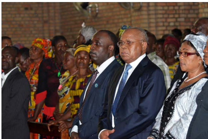
Opposition political leader Etienne Tshisekedi (Centre R) listens alongside opposition leader Eugène Diomi Ndongala (Centre L) during a “Peace in the East” mass on 22 June 2012

Decision adopted unanimously by the IPU Governing Council at its 203 d session (Geneva, 18 October 2018)