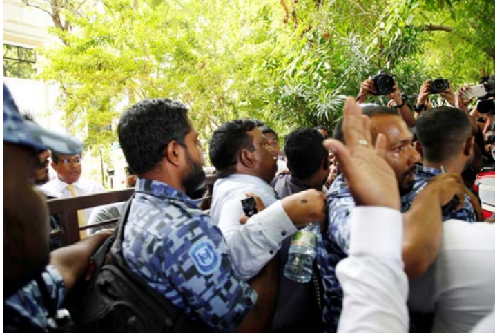
Police prevent members of parliament from entering the People's Majlis through the East Gate © Munshid Mohamed, 24 July 2017

Decision adopted unanimously by the IPU Governing Council at its 203 d session (Geneva, 18 October 2018)