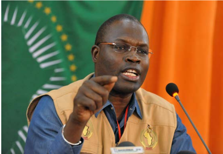
Dakar's mayor and head of the African Union's observation team, Khalifa Ababacar Sall, speaks during a press conference, on 13 March 2011

Decision adopted by consensus by the IPU Governing Council at its 203 rd session (Geneva, 18 October 2018) 1