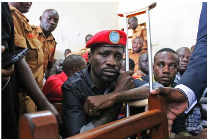
Mr. Robert Kyagulanyi, better known as Bobi Wine, appears at the High Court in Gulu, northern Uganda, on 27 August 2018.

Decision adopted unanimously by the IPU Governing Council at its 203 d session (Geneva, 18 October 2018)