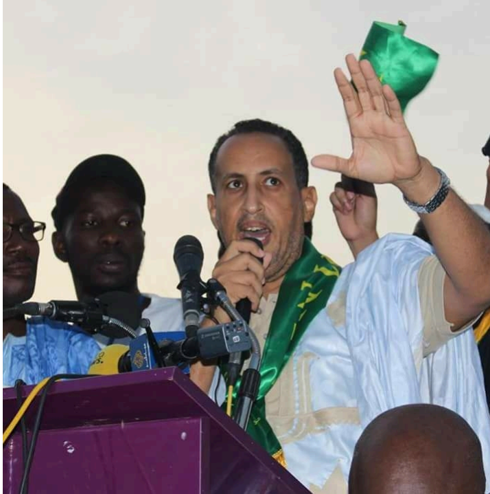
Mohamed Ould Ghadda

Decision adopted unanimously by the IPU Governing Council at its 203 rd session (Geneva, 18 October 2018)