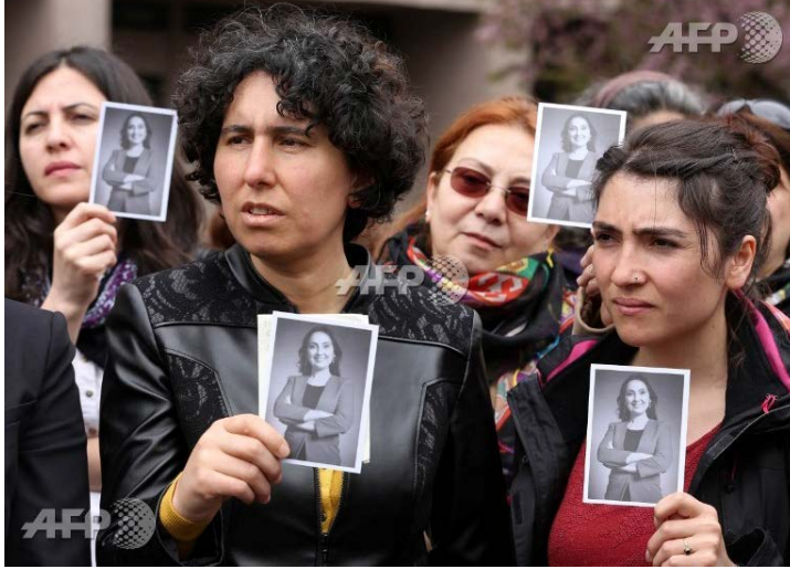
Demonstrators hold pictures of Figen Yüksekdağ during the trial in front of the court in Ankara on 13 April 2017

Decision adopted by consensus by the IPU Governing Council at its 203 rd session (Geneva, 18 October 2018) 6