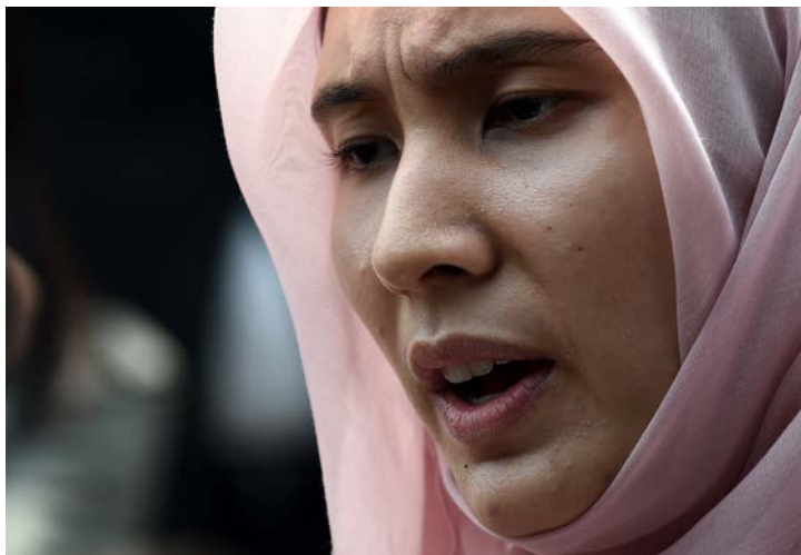
Nurul Izzah, daughter of Malaysian opposition leader, Anwar Ibrahim, speaks to the media after being released on bail on 17 March 2015

Decision adopted unanimously by the IPU Governing Council at its 203 rd session (Geneva, 18 October 2018)