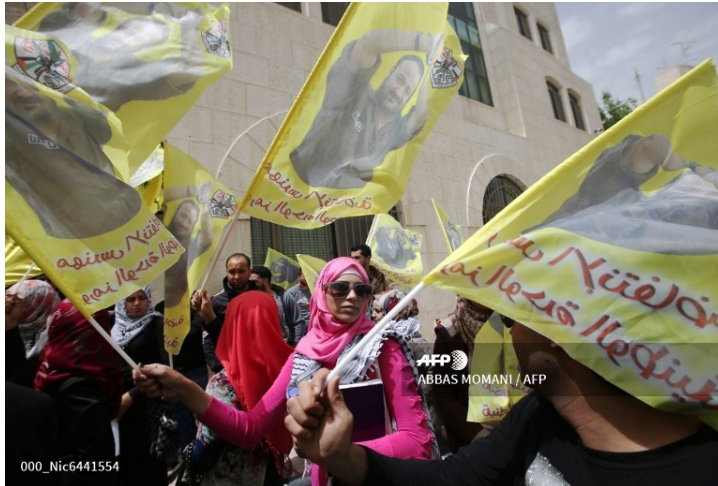
Ramallah, 15 April 2015 – Palestinian protesters wave flags bearing portraits of Fatah leader, Marwan Barghouti, during a march to mark the anniversary of his arrest.

Decision adopted unanimously by the IPU Governing Council at its 203 d session (Geneva, 18 October 2018)