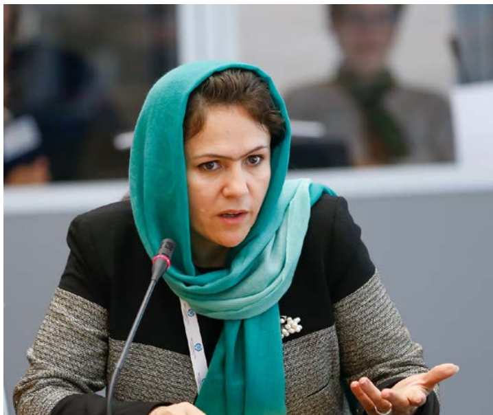
Fawzia Koofi

Decision adopted unanimously by the IPU Governing Council at its 203 rd session (Geneva, 18 October 2018)