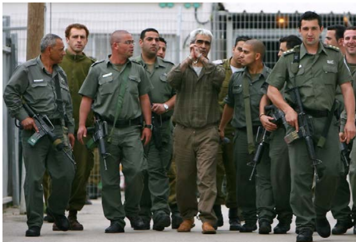
Ahmad Sa'adat, the leader of the Popular Front for the Liberation of Palestine, is escorted by Israeli border police to the Ofer military court in the West Bank, north of Jerusalem, 27 March 2006.

Decision adopted unanimously by the IPU Governing Council at its 203 rd session (Geneva, 18 October 2018)